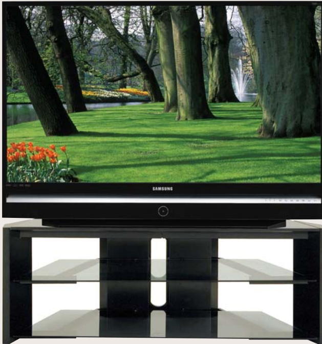
Shown with optional stand (TR50X3B)

56" Widescreen DLP® HDTV with 1080p Resolution